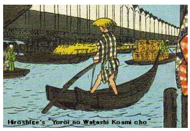
"Yoroi no Watashi Koami cho"(a part)."

source: "Hiroshige no Oh-Edo Meisho Hyakkei Sampo" (Jimbun-sha 1996)