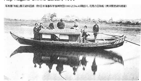
"Hiyoke-bune"; Sunshade (sightseeing) boat on the Sumida river, Tokyo in Meiji Period.