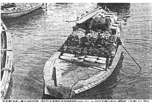
"Sedori-bune"; Transportation boat for shallow area. In the Nihonbashi river, Tokyo. There is a Ro on the top of the boat.