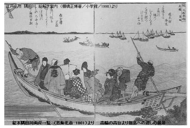
Just launched by two "Sao"; long poles. but there is a Ro prepared at the stern.